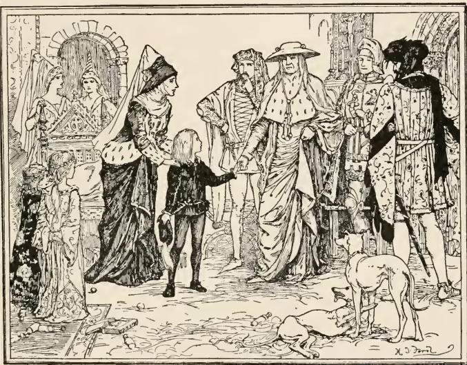
The Queen entrusts little Richard to the Cardinal

Elizabeth bowed her head in silence — it was no more than she had expected, and she awaited in the strength of despair what was to follow. It was not long in coming. Ten days later Richard III. was crowned in the Abbey with great splendour, and her brothers removed